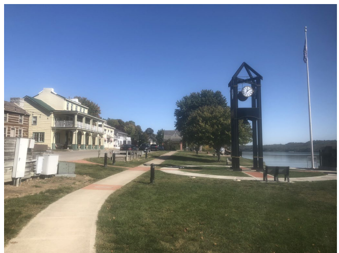
Rising Sun Riverfront Park Interpretive Walking Trail